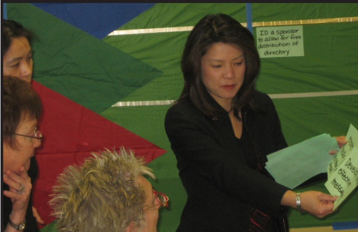
Below: ASC members participate in the Caregiver Support and Health & Wellness strategic planning workshops